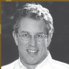
Bruce D. Perry

Bruce D. Perry, M.D., Ph.D., is the Senior Fellow of The ChildTrauma Academy. The Houston-based Academy is a not-for-profit organization that promotes innovations in service, research and education in child maltreatment and childhood trauma. He is the coauthor of The Boy Who Was Raised as a Dog: What Traumatized Children Can Teach Us about Loss, Love and Healing . This popular book is based on Dr. Perry's work with maltreated children. Over the past 20 years, Dr. Perry has been an active teacher, clinician and researcher in children's mental health and the neurosciences, holding a variety of academic positions.